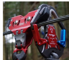
Compatible with majority of Karabiners/Snaphooks & with ISC SmartSnap System

Durable Acetal end stops protect the trolley frame. Zippey can be supplied with standard, flat end stops, or is available with hooked end stops (as an optional extra), onto which you can mount a secondary lanyard.